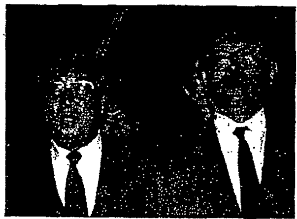
(S) North Korean President Kim Il-song (l) and Chinese President Jiang Zemin. Chinese and North Korean interests probably will diverge during any crisis over the North Korean nuclear issue, despite their formal solidarity.