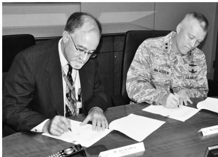
Mr. Joe Sciabica and Maj. Gen. J. Kevin McLaughlin sign an Air Force Civil Engineer Center-Air Forces Cyber collaboration agreement. The initiative is designed to enhance the security of industrial control systems that support critical Air Force infrastructures around the world.