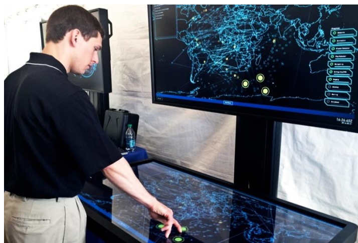
The Defense Advanced Research Projects Agency (DARPA) Plan X program is a foundational cyber warfare program that is developing platforms for the Defense Department. DARPA uses advanced touch-table displays to use finger gestures and motions to advance the state of the art in cyber operations.

DoD will have a framework in place to cooperate with other government agencies to conduct defend the nation operations. DoD will work with FBI, CIA, DHS and other agencies to build relationships and integrate capabilities to provide the President with the widest range of options available to respond to a cyberattack of significant consequence to the United States.