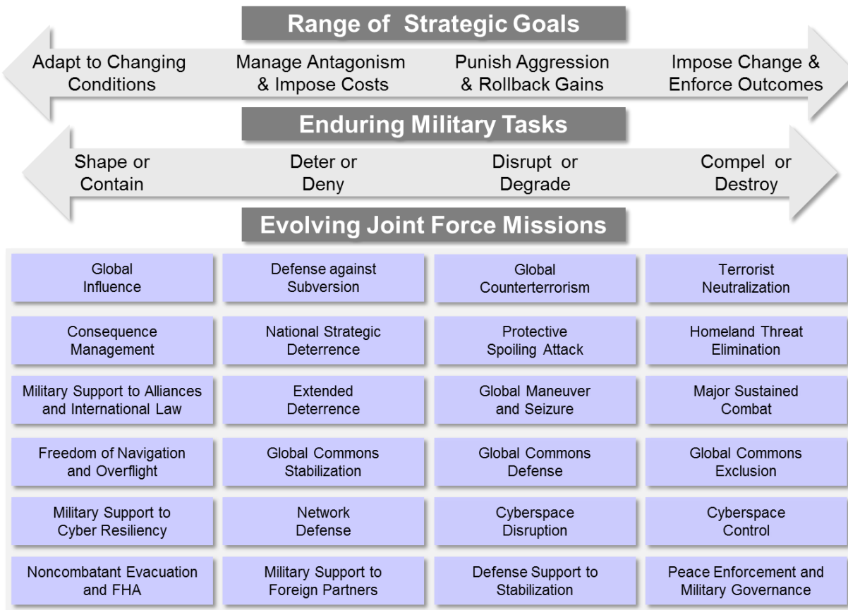
Figure 10. Evolving Joint Force Missions

To secure the broadest interests of our Nation, political leaders will demand real options from their military. In turn, military leaders require clear strategic guidance and assurance that political leaders understand what military power can feasibly achieve and the consequences of using military power. This range of missions is a start point for that future dialogue – a dialogue whose outcome is shaped by the force development activities of today (see Figure 10).