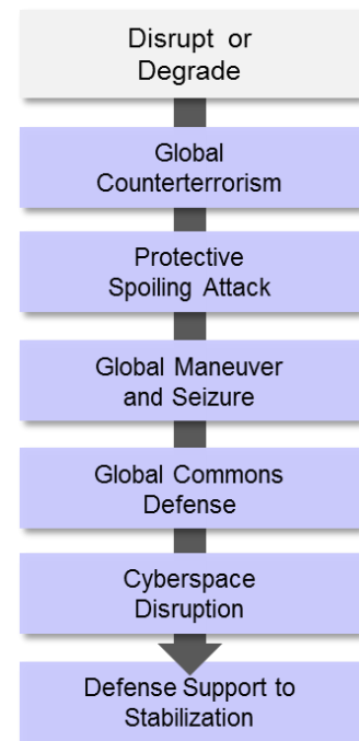
Figure 8. Missions to Disrupt or Degrade

The future Joint Force will conduct missions designed to disrupt an adversary’s ability to pursue unfavorable changes to the security environment or physically degrade their capacity to secure objectives. Furthermore, it must do this against competitors with very large and capable militaries, that are often sheltered under a nuclear umbrella, protected by other political or military factors, concealed by dispersed networks, or operate amongst the people. Figure 8 illustrates the potential missions the future Joint Force may conduct to disrupt or degrade.