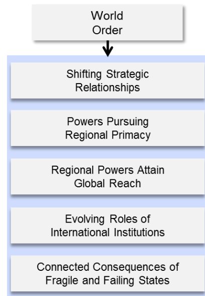
Figure 2. Conditions in World Order

The Joint Force will face a future world order largely defined by the conditions listed in Figure 2. Over the next two decades, many of the rules and norms governing the international system will come increasingly under pressure. In a world with no overarching global authority, rules are only as strong as the willingness of states to follow or enforce them. Some rising powers will be dissatisfied with the ability of international institutions to accommodate their growing power and influence. Furthermore, they will strive for the political will, economic capacity, and military capabilities to compel change at the expense of the United States, its allies, partners, and global interests. Other declining, though still powerful, states will seek to insulate themselves from international norms and rules in order to create the political space necessary to threaten and coerce neighbors.