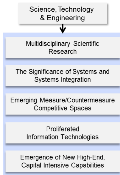
Figure 4. Conditions in Science, Technology & Engineering

The Joint Force will face a future technological landscape largely defined by the conditions depicted in Figure 4. The U.S. approach to high-technology warfare over the past two decades has encouraged the development of asymmetric, unconventional, irregular, and hybrid approaches by adversaries. Adversaries will continue to innovate by applying varying mixes of high and low technologies to frustrate U.S. interests and military forces. By 2035, the United States will confront a range of competitors seeking to achieve technological parity in a number of key areas. Adversary forces will be augmented by advanced C3/ISR and information technologies, lethal precision strike and area effect weapons, and the capacity to field first-rate technological innovations. The cumulative result will be a situation in which, “Our forces face the very real possibility of arriving in a future combat theater and finding themselves facing an arsenal of advanced, disruptive technologies that could turn our previous technological advantage on its head – where our armed forces no longer have uncontested theater access or unfettered operational freedom of maneuver.” 9