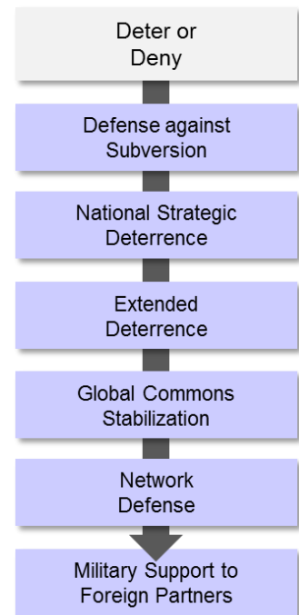
Figure 7. Missions to Deter or Deny

The Joint Force must be prepared to protect and defend key U.S. interests against adversaries who attempt to shape or otherwise alter the security environment at the expense of the United States or its allies. Consequently, the future Joint Force will conduct missions to deter or deny adversaries from engaging in coercive strategies or benefiting from conflict and war by raising the potential costs of their actions above what they are prepared to bear. Figure 7 illustrates the potential missions the future Joint Force may conduct to deter or deny.