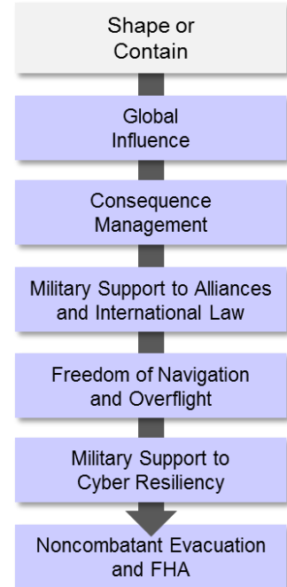
Figure 6. Missions to Shape and Contain

In the future, several aggressive states will challenge the U.S. system of alliances and partnerships, or seek to successfully change international rules in their favor. Consequently, the Joint Force must be prepared to provide Military Support to Alliances and International Law . For this mission, the Joint Force should reinforce existing or support the development of new alliances and partnerships in anticipation of adversary initiatives. This might include the ability to understand adversary