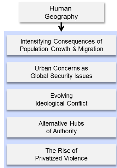
Figure 3. Conditions in Human Geography

The Joint Force will face a future socio-cultural world largely defined by the conditions depicted in Figure 3. The future security environment will feature large areas of the globe where states struggle to maintain a monopoly on violence and individual identities are no longer based exclusively on a sense of physical location. Individuals and groups will connect and socialize globally. Widespread economic growth will raise millions out of poverty into longer and more comfortable lives. However, a richer human world lacking legally constituted and legitimate governance may lead to dissatisfaction, violence, and even the emergence of violent transnational ideologies that disrupt local, state, or regional governments. Growing wealth can also stress food, water, energy, and other resources, causing higher prices and shortages which may translate into instability, civil conflict, and the failure of governments. Fractured and failed governments may transmit disorder more broadly or become geopolitical opportunities for more well-ordered and aggressive states.