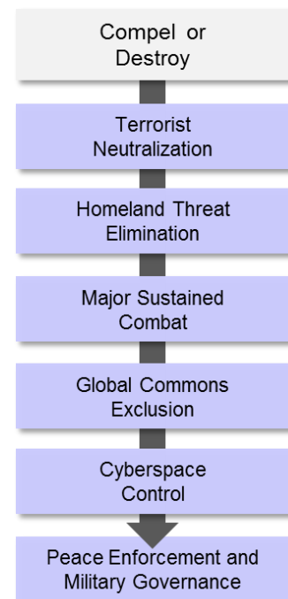
Figure 9. Missions to Compel or Destroy

The Joint Force must be prepared to fully defeat adversaries directly threatening the United States or the global system of allies, rules, and norms that it supports by ensuring that they are no longer willing or able to present a threat to U.S. interests. Consequently, the Joint Force will