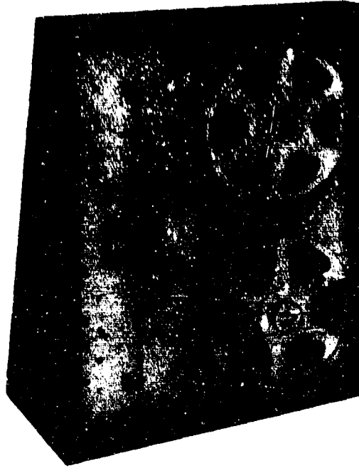
Figure 3 - Potter Magnetic Tape Handler