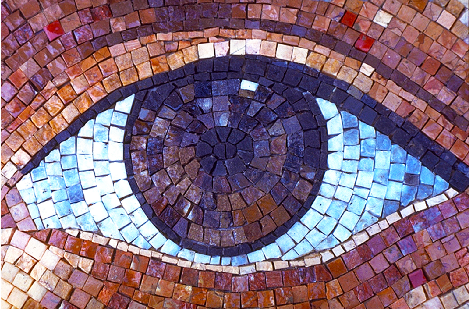
Oculus 7 (Andrew Ginzel) | CC BY-NC-SA-2.0