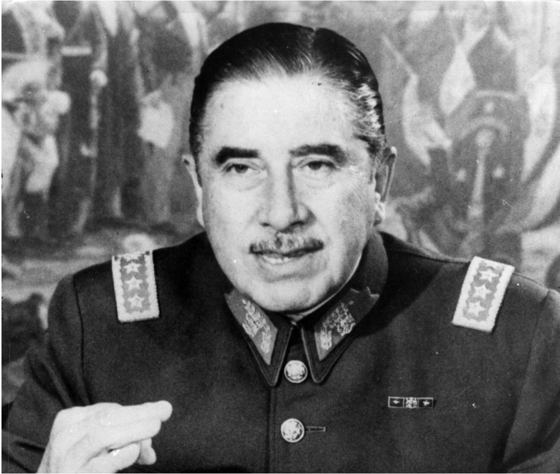
Photograph of Pinochet.