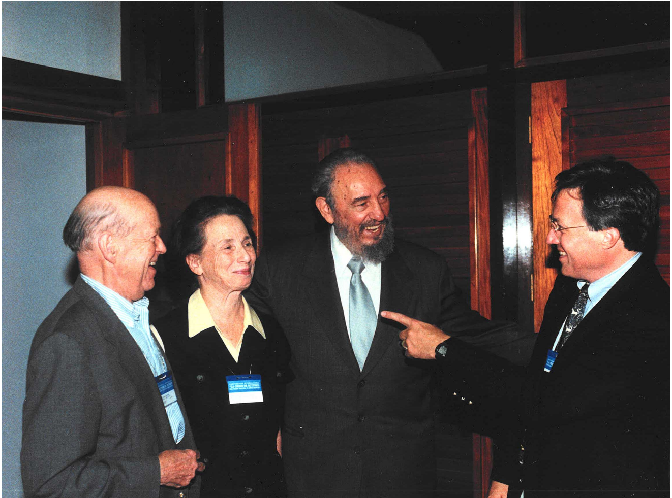
Blanton and the archive persuaded Fidel Castro (left) to share Cuban Missile Crisis documents.

Another way of ferreting out information is a bit hit-or-miss—but when it hits, it hits big. Call it we'll-show-you-ours . Cuba is an ongoing fixation for the archive, which is working to obtain every gettable scrap of paper detailing US relations with the country. In the early 1990s, with much still unknown about the Cuban Missile Crisis, the organization put together a conference at Havana's Palace of Conventions in commemoration of the event's 30th anniversary. It brought thousands of pages' worth of once-secret US documents and asked Cuban officials to match them with its own records. Then-president Fidel Castro, Blanton says, "snapped his fingers and these three burly guys came out," dropping multiple bankers' boxes of instantly declassified documents on the conference table. Among them: a previously unknown 7,000-word letter to Castro from Russian leader Nikita Khrushchev sent in the months following the crisis, seeking to mollify the Cuban leader.