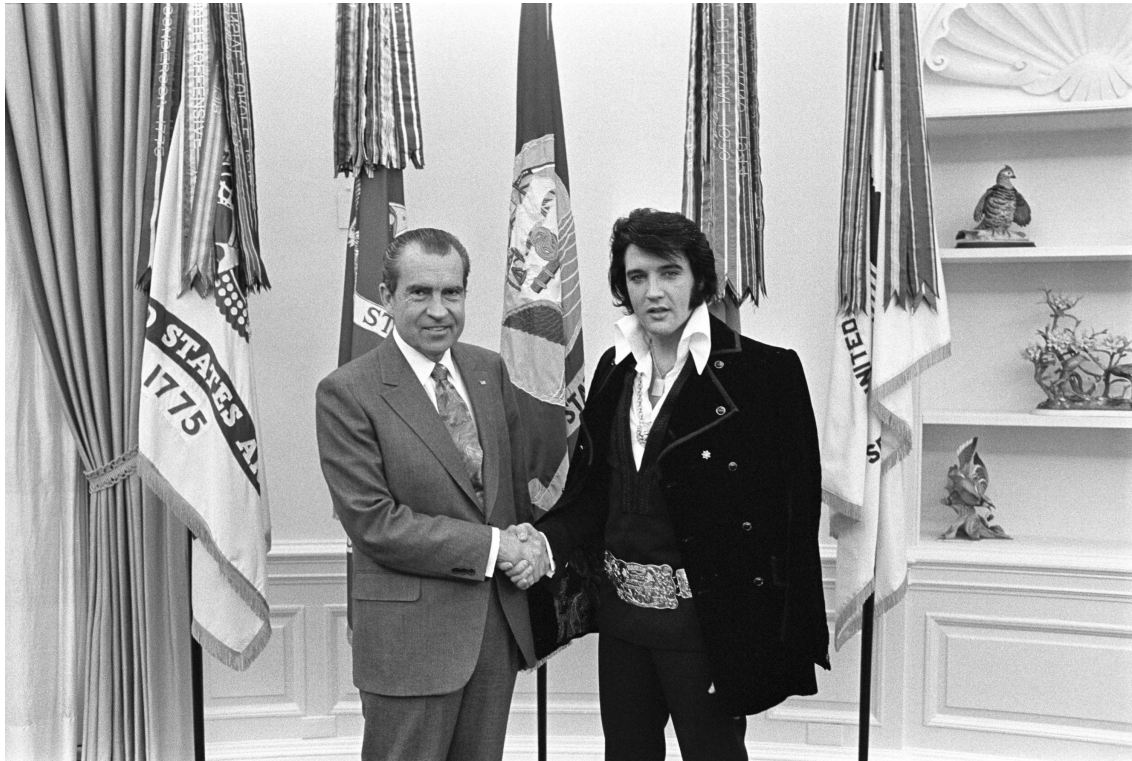
Photograph of Nixon and Elvis