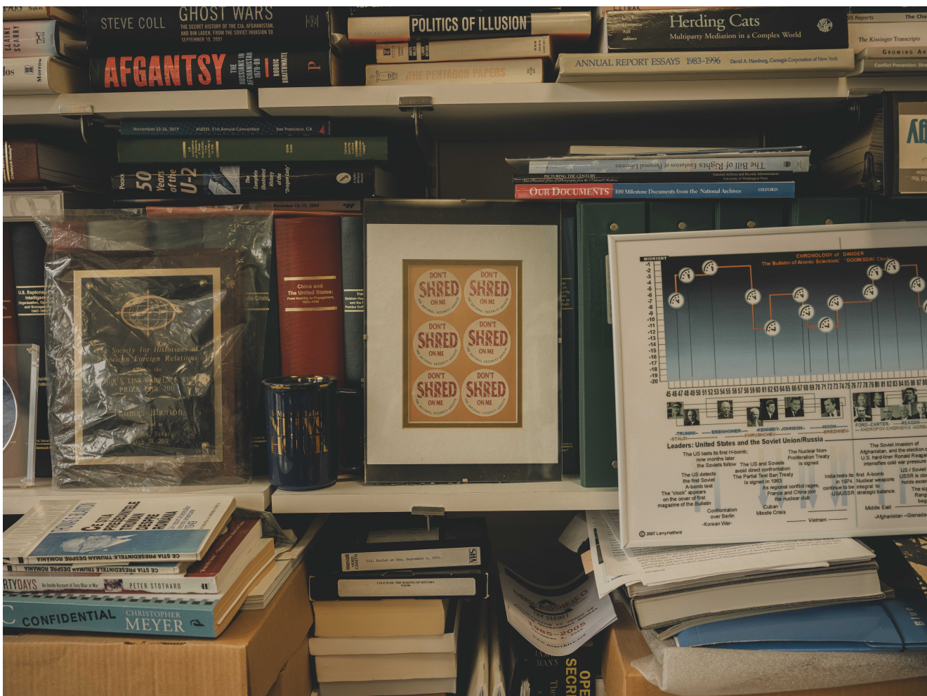
Located at George Washington University, the archive is stacked with boxes of documents—and some more whimsical items.

Then there are the documents the archive exists to uncover: protected information that, when dragged into the light, helps us see the unredacted truth about our own history, the better to avoid repeating mistakes. For example, the CIA’s “Family Jewels”—an internal compendium of assassinations plots, domestic spying, and secret tests of mind-altering drugs such as LSD that prompted congressional investigations in the 1970s and that the agency finally released to the archive for public consumption in 2007. The archive also has helped India and Mexico write freedom-of-information laws, provided expert testimony in international human-rights trials, and sued multiple presidential administrations—most notably Donald Trump’s —for alleged failures to keep and share records with the public.