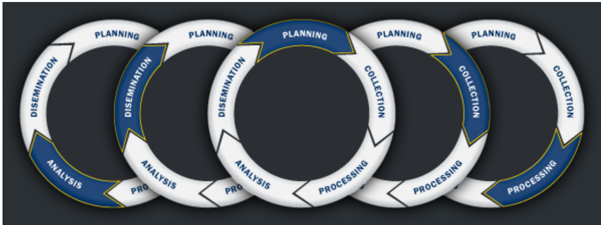
Figure 2 - Intelligence Cycle 24

direction, collection, processing and exploitation, analysis and production, and dissemination. These five steps are well developed for ISR support to the air and space domains of warfare.