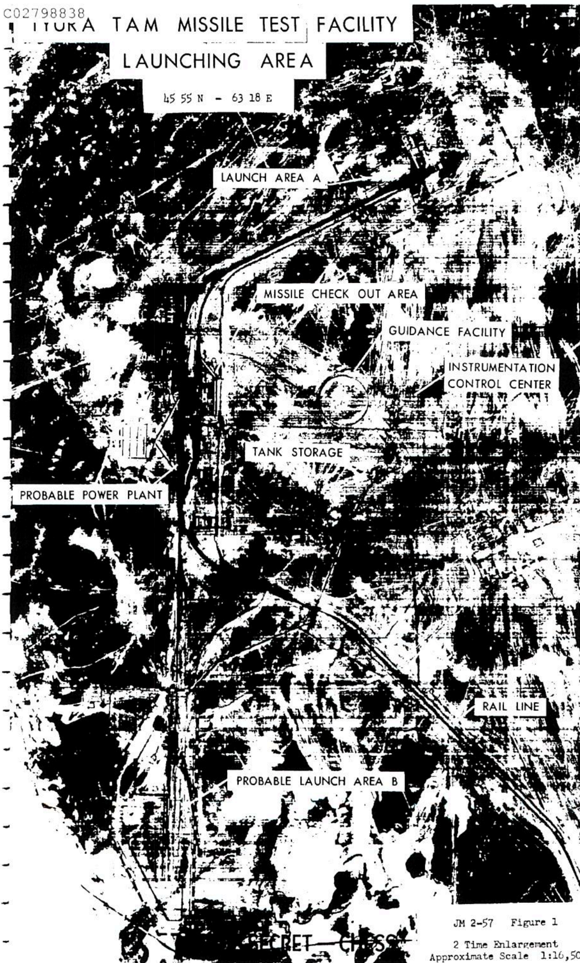
JM 2-57 Figure 1

2 Time Enlargement Approximate Scale 1:16,500