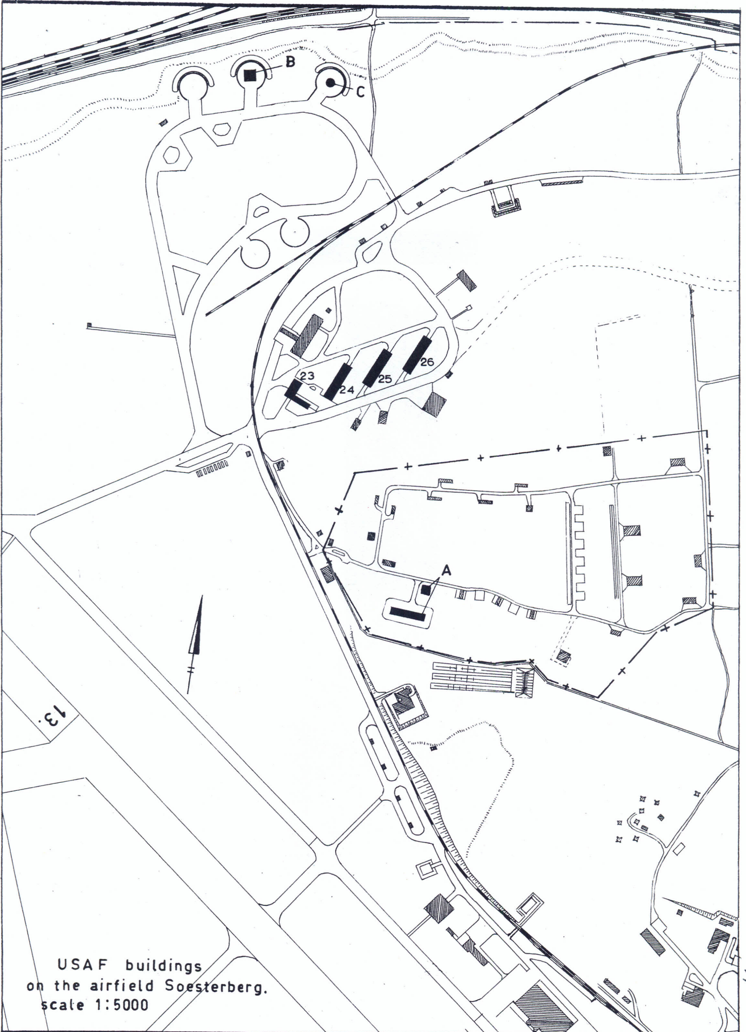
USAF buildings on the airfield Soesterberg. scale 1:5000