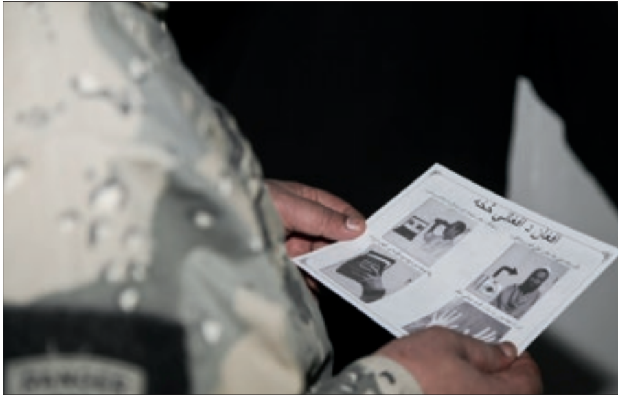
Border police at Wesh review information flier about Afghan 1000 Biometrics Facility

The use of biometrics in identifying IED makers and emplacers has been an ongoing achievement, first in Iraq and now in Afghanistan.