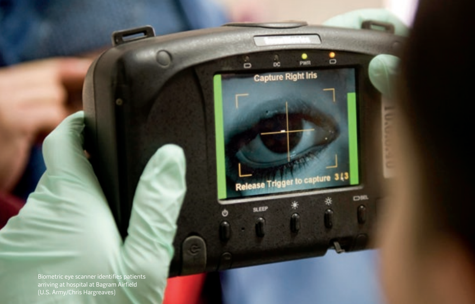
Biometric eye scanner identifies patients arriving at hospital at Bagram Airfield