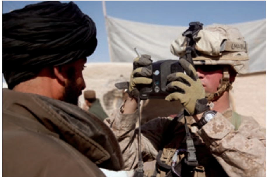
Marine gathers identification information from Afghan during census patrol in Helmand Province

It did not matter that the Afghan police officers who identified and apprehended him could not read or write. What did matter was that by using the earliest form of biometric identification, facial recognition, the officers removed a dangerous bomb maker from the battlefield, making the area safer for not only coalition and Afghan security forces, but