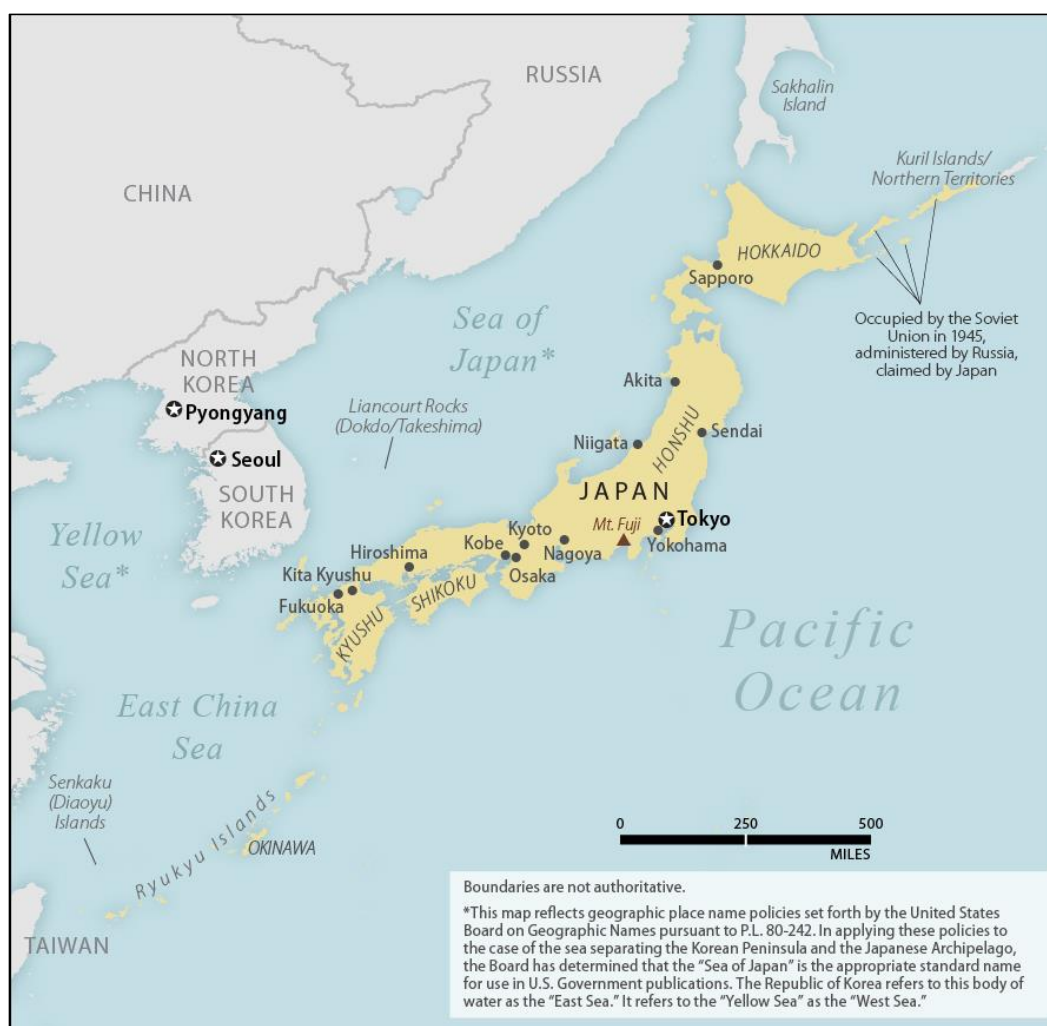
Figure I. Map of Japan