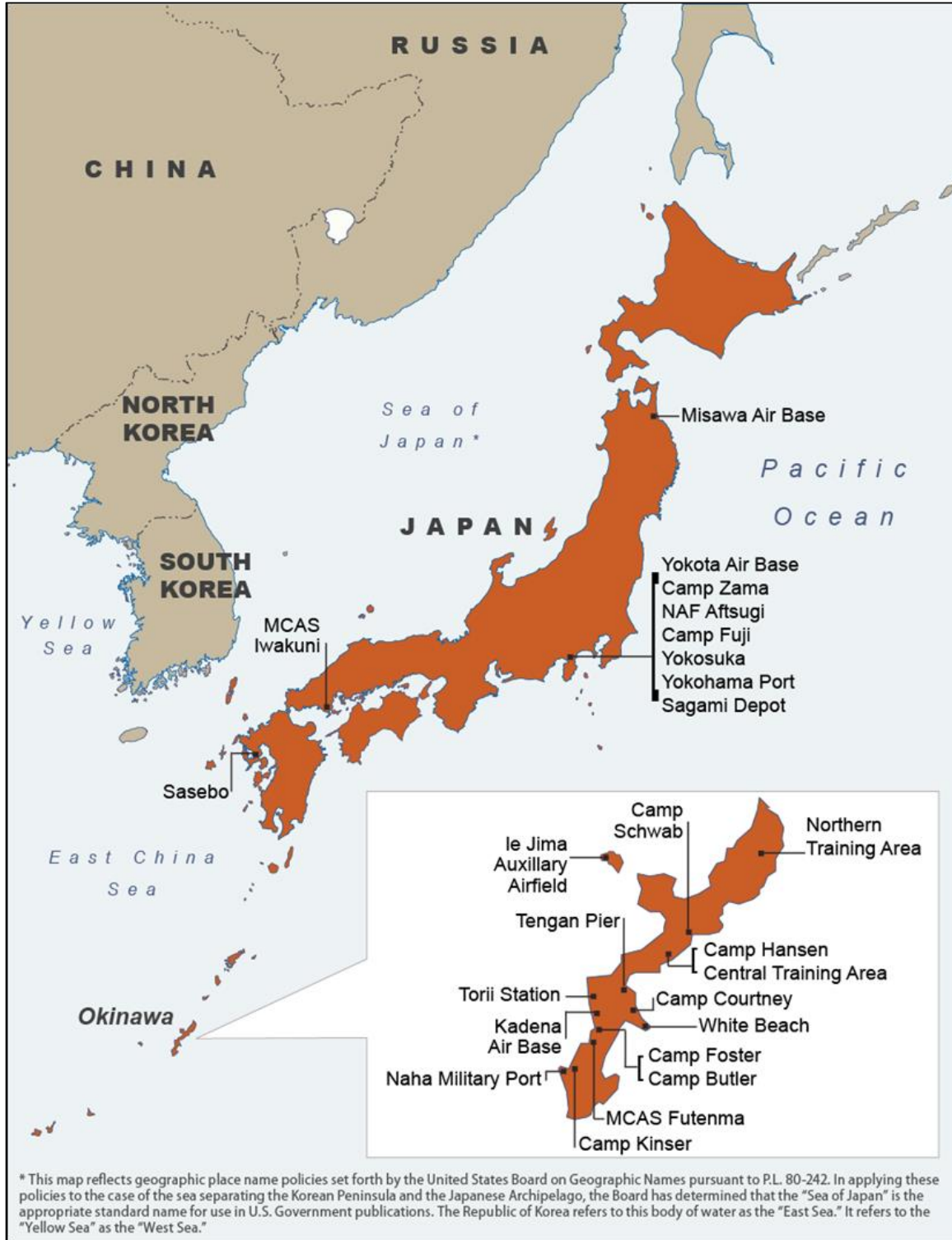
Figure 4. Map of U.S. Military Facilities in Japan