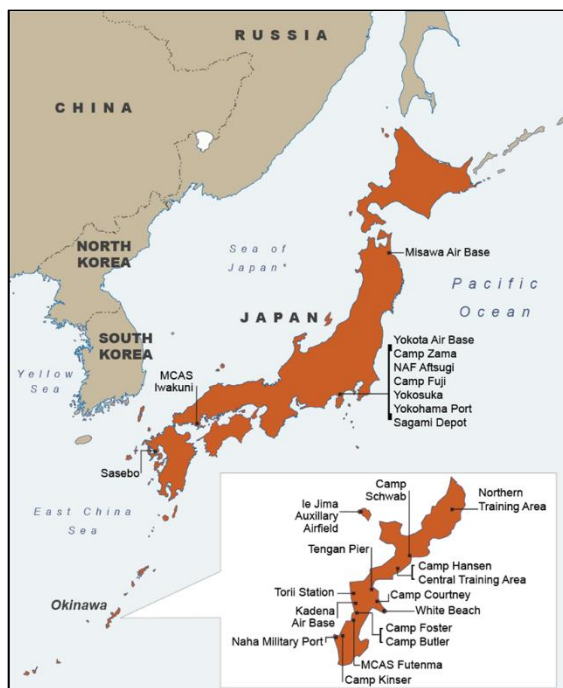
The U.S. Military in Japan: 54,000 troops with the exclusive use of 85 facilities

Japanese Prime Minister Shinzo Abe is a stalwart supporter of the alliance and has had notable success on his ambitious agenda to increase the capability and flexibility of Japan's military. Abe's dominance over Japanese politics since his election in late 2012 has created opportunities for more predictable alliance planning. Although constitutional, legal, fiscal, and political barriers hinder further development of defense cooperation, Japan is steadily expanding its capabilities and, subtly, its attitude toward the use of military force, which is constrained by the Japanese constitution.