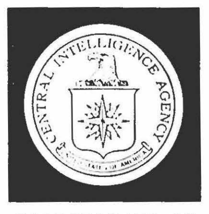
DIRECTORATE OF INTELLIGENCE